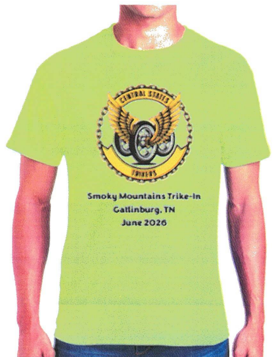
Central States Trikers Logo